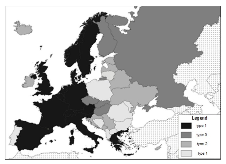
Fig. 5. Typology of European countries by the type and nature of migration, 2015

An analysis of quantitative indicators of international migration processes makes it possible to identify several types of states based on the criteria of intensity and direction of migration processes (fig. 5).