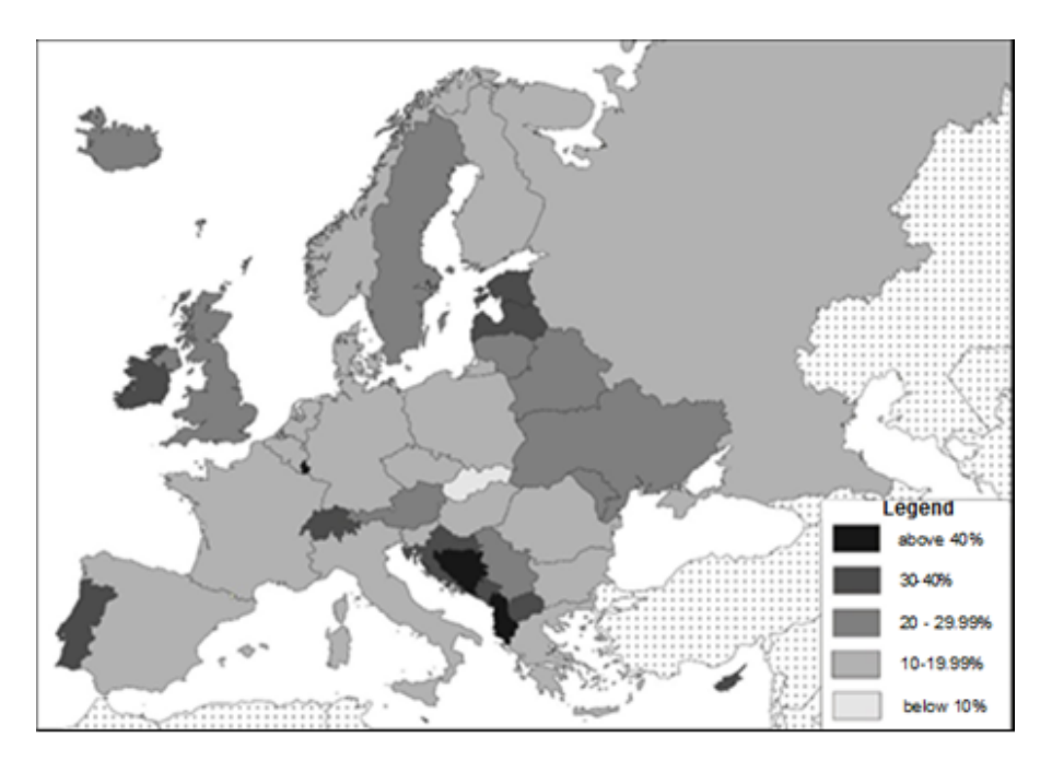
Fig. 4. Migration process intensity (MPI) in European countries, 2015

After 1990, the pattern of involvement in international migration changed dramatically in most European countries. An average MPI increased from 13.6 to 18.4%. There are almost no countries with a low MPI. The minimum value (9.6%) is observed in Slovakia — a country that is neither prosperous enough to attract migrants from developing countries nor poor enough to become a country of origin. Today, immigrants and emigrants account for 20% of the total population in 22 out of the 40 European countries, and over 30% in 13 European states (fig. 4).