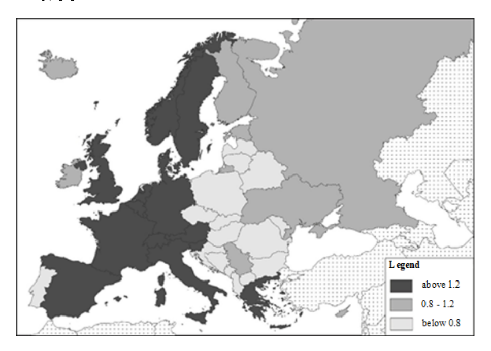
Fig. 1. International migration coefficient (IMC) in European states, 2015.

In 2015, the number of immigrants exceeded that of emigrants by 28%, i. e. the IMC reached 1.28. However, this coefficient ranges from country to country. The first group of countries with an IMC of above 1.2 brings together 15 states situated in the North-West of the continent. All these countries, with the exception of Slovenia and Cyprus, are historically the most developed countries of the world having a very high Human Development Index and a high per capita income (fig. 1). In Spain, Sweden, Luxembourg, Switzerland, France, Norway, and Germany, the ratio is 3—5 immigrants per one emigrant. Italy and Great Britain — the most popular destination countries in the recent decades — have a moderate IMC ranging from 1.5 to 2. This is explained by the fact that, until recently, these countries were the largest sources of emigration. Just quarter a century ago, Great Britain and Italy were classed as countries, where the number of immigrants was much higher than that of foreign-born residents (the IMC of 0.9 and 0.4 respectively) [2].