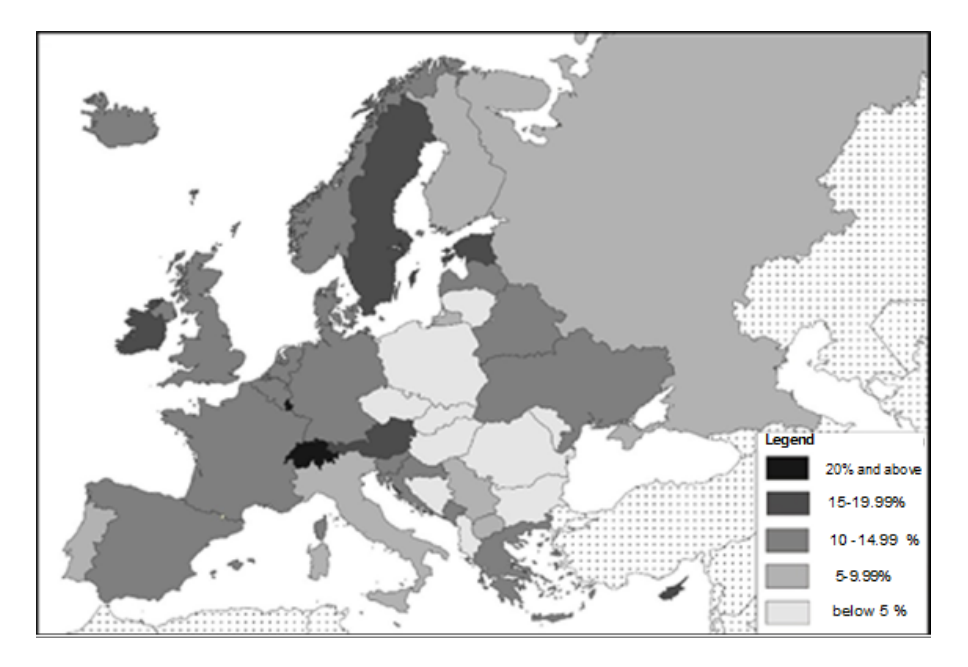
Fig. 2. Proportion of immigrants in total population of European countries, 2015